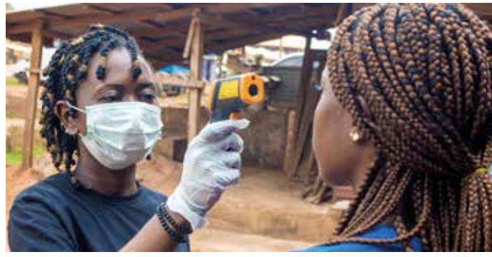
The goal of PREZODE is to improve monitoring and early warning systems throughout the world in order to prevent pandemics

The AFRICAM project, launched in February 2023, aims to reduce the risk of emergence of zoonotic pathogens with epidemic potential in four African countries (Cameroon, Guinea, Madagascar and Senegal) and in Cambodia. The first project implemented as part of the international PREZODE initiative, it is coordinated