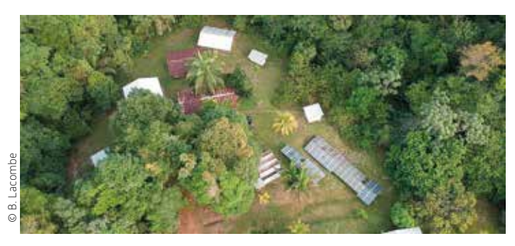
Paracou forestry system, French Guiana

The goal of the ALT project is to improve the parameters of vegetation models for the tropical forests of French Guiana in order to build knowledge about forest regeneration potential and the dynamics of the canopy, by combining inventory and remote sensing observations. The key question is whether these forests will be resilient to climate disturbances.