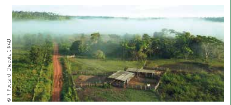
Paragominas, in Brazil, is one of the TerrAmaz project's five pilot sites

The TerrAmaz project supports Amazon territories in the implementation of policies to combat deforestation. The goal is to encourage the transition to a development model that articulates social development, low-carbon economic development and biodiversity conservation.